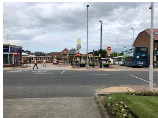
Heswall Bus Station

Start the walk at the bus station in Heswall. Look across the main road towards a large building opposite named 'Heswall Community Fire Station' which is home to the fire engines. There is a big tower behind the building. This is called a Drill Tower.