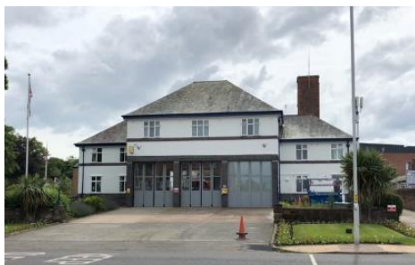
Heswall Community Fire Station

Q1: Do you know what the Drill Tower is used for by the firefighters?